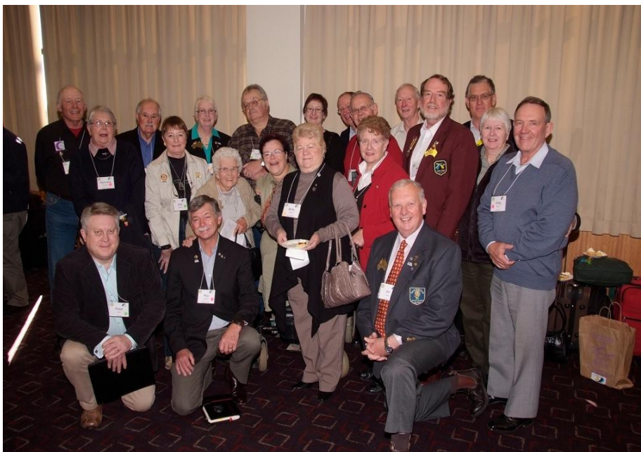
Canberra Australian Rotary Conference August 21-22 District 9700 Delegates. {Story and more photos in next week's bulletin}

COOLAMON ROTARY CLUB WEB SITE: http://www.coolamonrotary.com