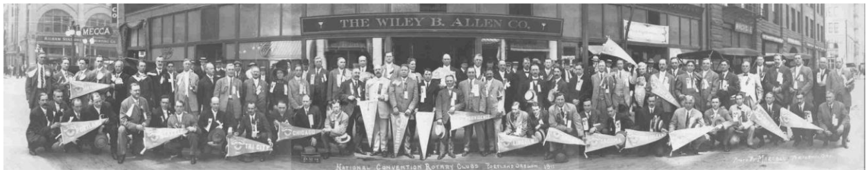
1911 Delegates to the second convention of Rotary in Portland.