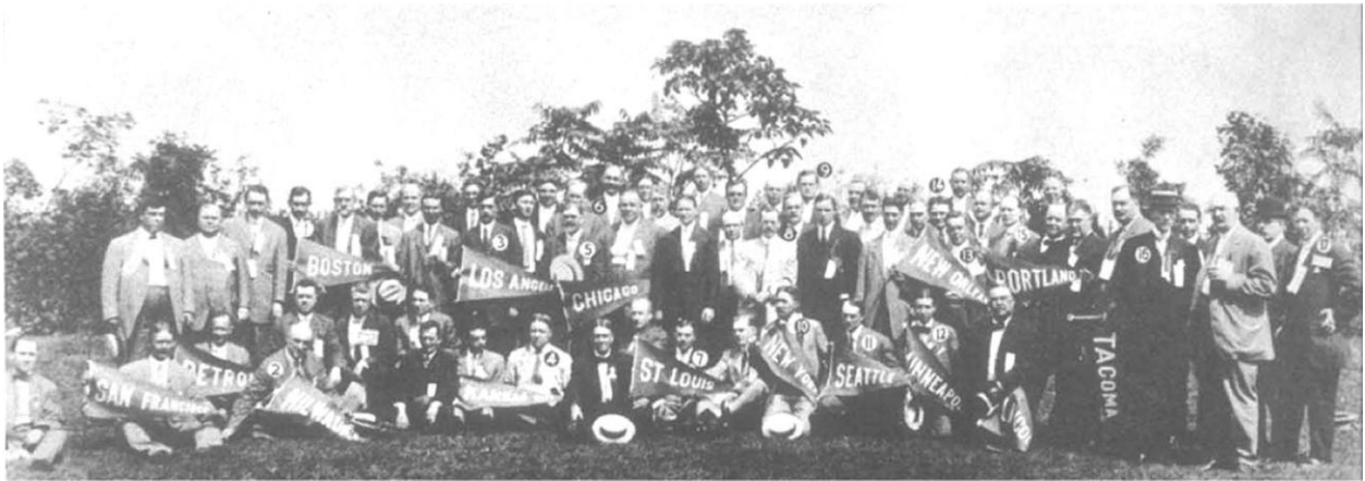
1910 Delegates to first convention of Rotary in Chicago.