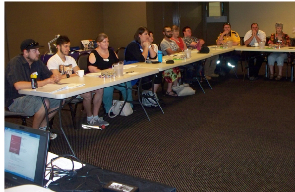
Part of the Group of 40 attendees who were at the Seminar on Wednesday 19 th February.