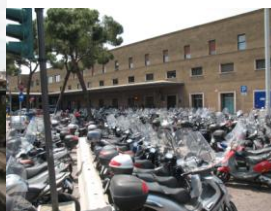
Not sure which one of these is mine