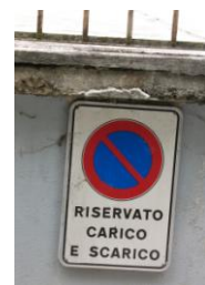
Hell! What's this mean? Might have to give it a miss pity