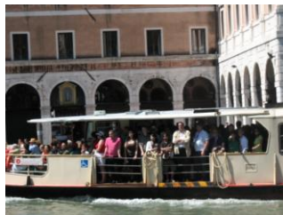
Boats a bit crowded

Wow - here we are in Venice and I didn't expect the Book Fair message to have spread so far - this quaint bookshop seems to have its book donations bundled up out the front, ready for us to take. Hmmmm might be a bit far for Graham or Bruce to do a pick-up. What's the other options?