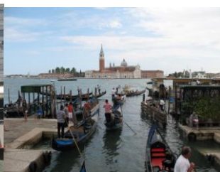
Gondolas a bit slow