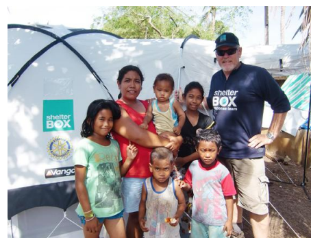
ShelterBox in the Philippines

Tickets: Contact Bruno Fic 0413 613 387 or E. tdfic@optusnet.com.au