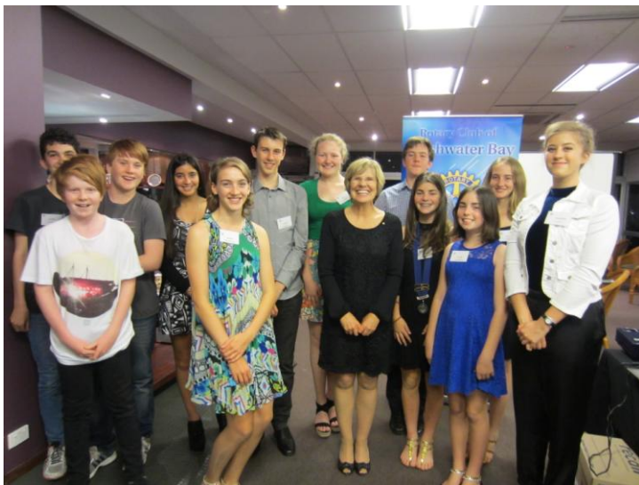
Members of the Interact Club of Freshwater Bay