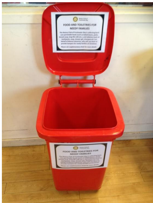
Tubs for Manna & Passport Project