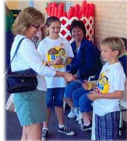
The Rotary Club of Bourne End and Cookham started a RotaKids club in March 2010 at Carrington School

From the outset joint projects are encouraged, we have also had Interactors and Rotaractors help out at Rotakids. Interactors from very early in their Interact life get to regard visits to Rotary as the norm. It is also good for our members who have to interact (sorry awful pun) with young people who they are not connected or related to so they can't play the grandparent card etc.