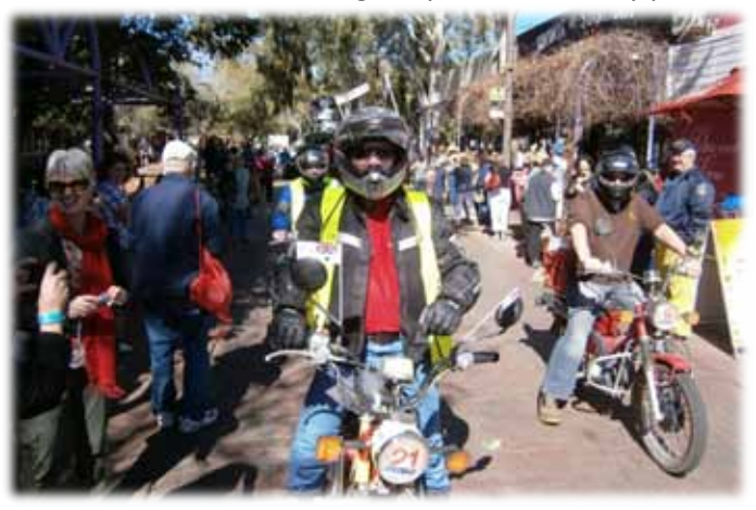
This year there were 37 male riders and 7 females ranging from 25 to 76 years of age.

This was the tenth annual ride and covered 4000 kilometres of inland sand highways over a ten day period.