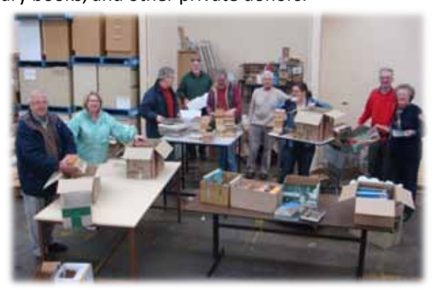
Book Fair sorting

The books were sourced from decease estates, cancelled library books, and other private donors.