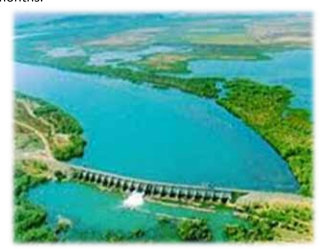
The Ord River Diversion Dam with Lake Kununurra. View looking southward

On 2<sup>nd</sup> May 2009 we inducted 14 new members, and we increased our membership to 40 in the space of 3 months.