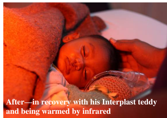
After—in recovery with his Interplast teddy and being warmed by infrared