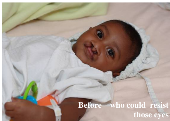
Before—who could resist those eyes