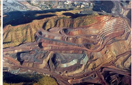
ARGYLE OPEN CUT DIAMOND MINE