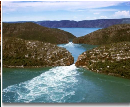
THE HORIZONTAL WATERFALLS