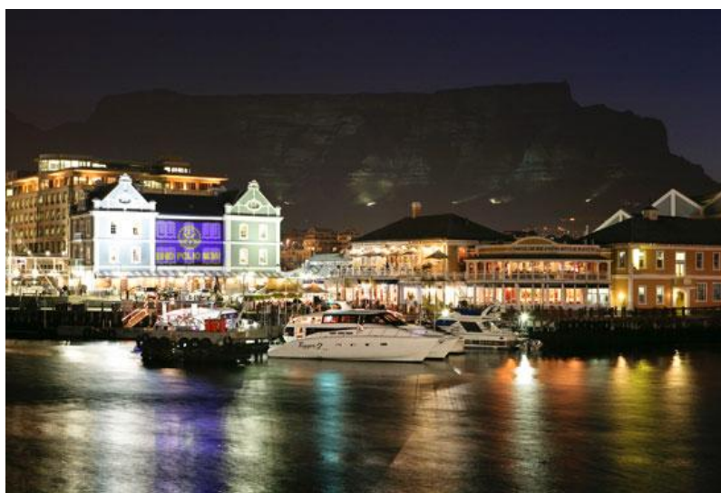
End Polio Now Cape Town

Read more on this initiative in the Rotarian or Rotary Down Under or on the Rotary International web site: http://www.rotary.org/en/MediaAndNews/TheRotarian/Pages/IN_Africa1011.aspx