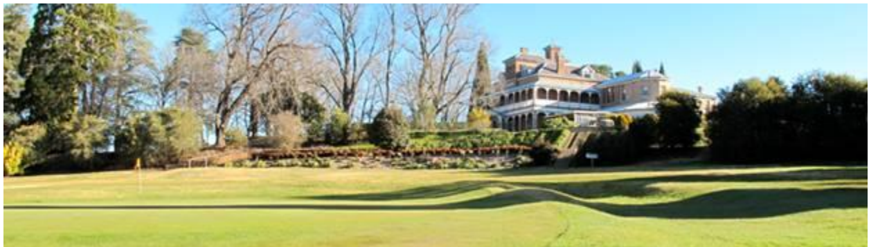
Duntry Golf Club Orange

You need to book your accommodation very soon if you are going to Orange.