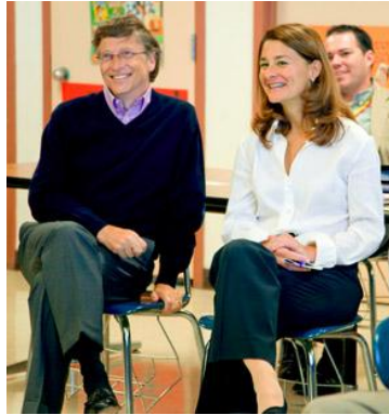
Bill and Melinda Gates