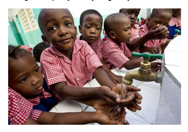
Children line up for water in Haiti. Rotary Images/Alyce Henson

A child drinks clean water from a spigot in Haiti. A US$64,566 contribution from the Haiti Earthquake Relief Fund is supporting a project of the Rotary Club of Mirebalais, Centre, to construct 80 rainwater collection tanks, each with a 2,500-gallon capacity. Rotary Images/Alyce Henson