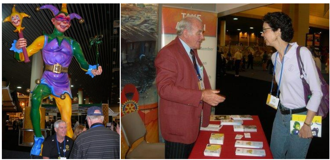
Let the good times roll

Some photos below from the 102<sup>nd</sup> Rotary International Convention held this week, more stories, more videos and more photos on our club web site during the next few days of the convention.