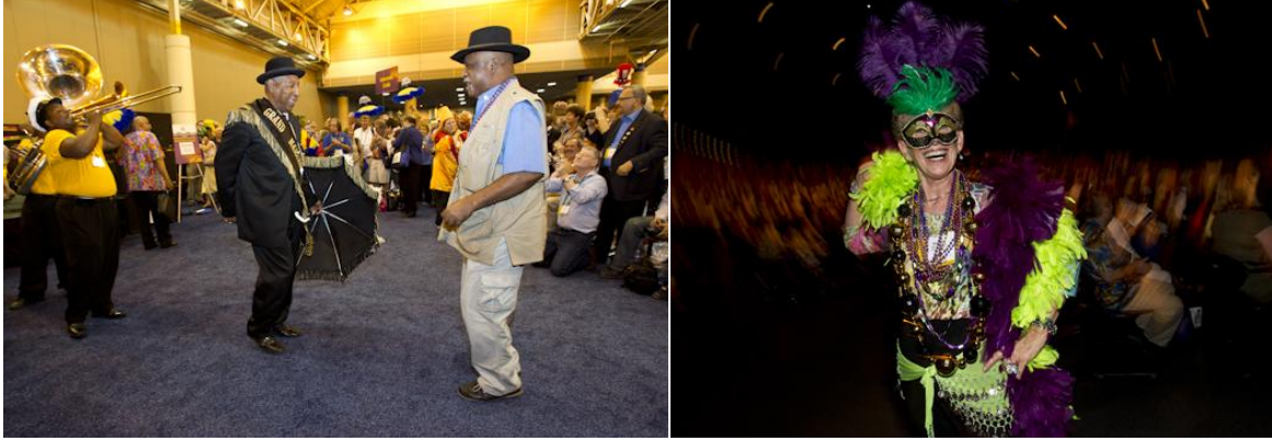
The Grand Marshall of the brass band