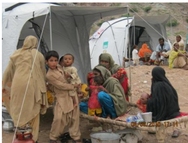
ShelterBox tents in use in the region

'The priority in terms of aid is shelter for those who have lost their houses. Many have taken refuge in open and high lying areas and the risk of disease and malnutrition is high. 'Shelterbox tents are now up and running in these areas and as these pictures show, families are using them as shelter in some very difficult terrain.'