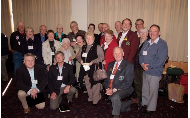
District 9700 Delegates