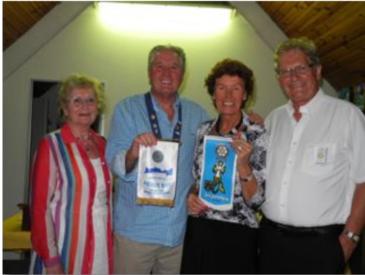
banner exchange on Tuesday