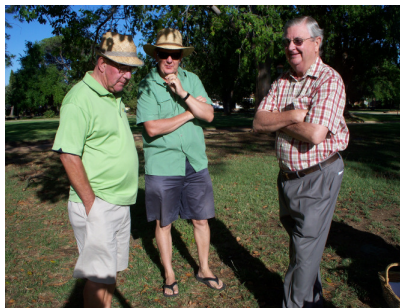
while three wise men pondered the fact that there were new cooks in training!