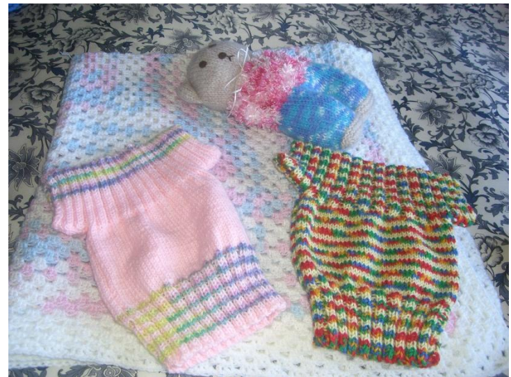
Knitted jumpers, toys and blankets