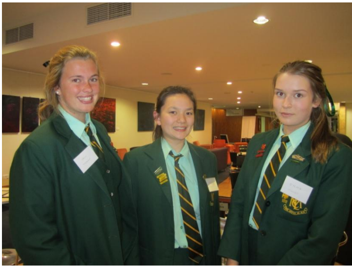
MLC students sponsored to attend RYPEN by RCFB