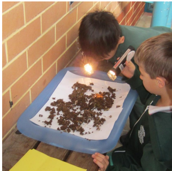
Children using Microscopes

The RC of Busselton-Geographe Bay has agreed to sponsor the request for units from Capel Primary School and the RC of Victoria Park have gained