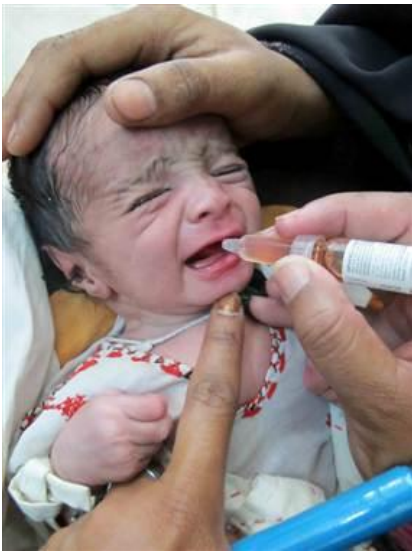
Pakistani health workers administer polio vaccine

WHO officials say 18 people, including health workers and police officers, have been killed and seven others injured during attacks since July 2012.