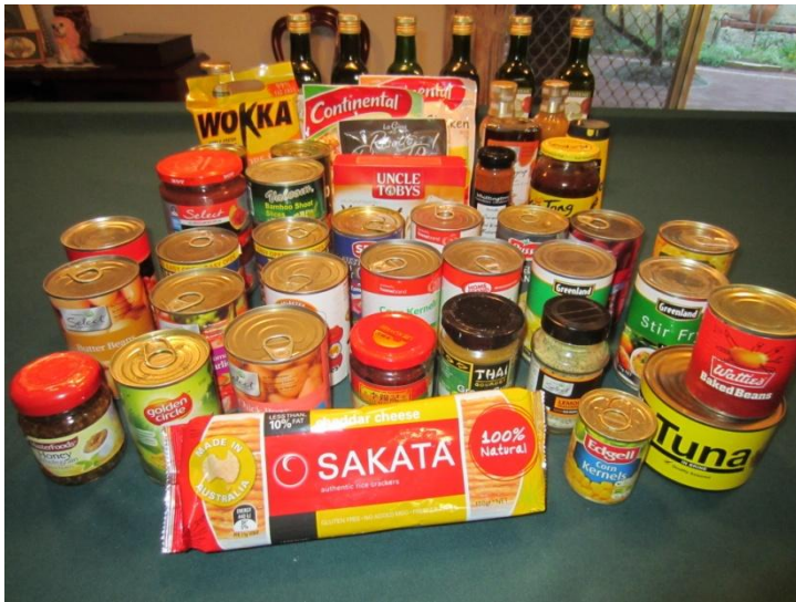
Some of the items collected last Christmas