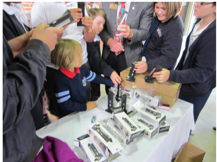
Microscopes in Schools project