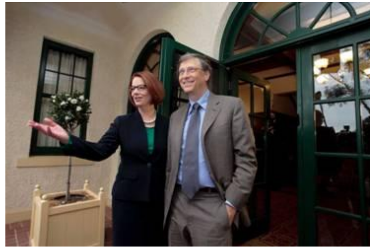
Prime Minister Julia Gillard and Bill Gates at the Lodge 28th May 2013

Australia will provide $80 million over four years from 2015 to 2018 to help finish the job and achieve worldwide polio eradication.