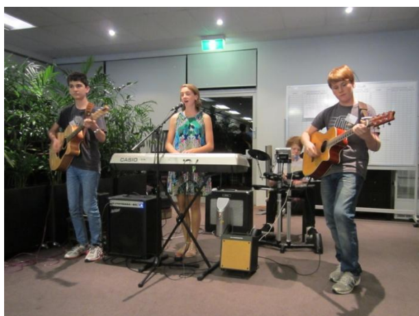
Band – Mixed Business