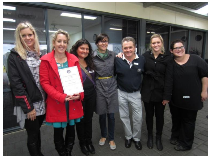
Teachers from Shenton College Deaf. Ed. Centre