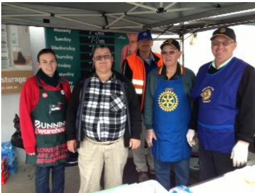
Motley Crew at Bunning