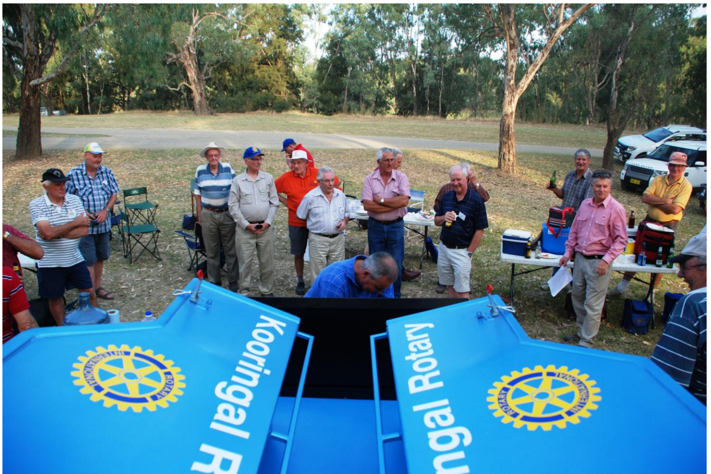
Enjoying fellowship at Wiradjuri Reserve while learning how to use the club's new barbeque –