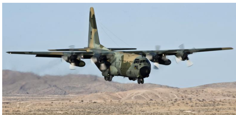
Left – C-130 Hercules

In time, he returned to Richmond as a logistics manager for C-130J Hercules fleet doing productive work for all sorts of military and humanitarian purposes such as fodder drops. He was then appointed Senior Engineering Officer for 12 C-130H and 200 maintenance and supply personnel.