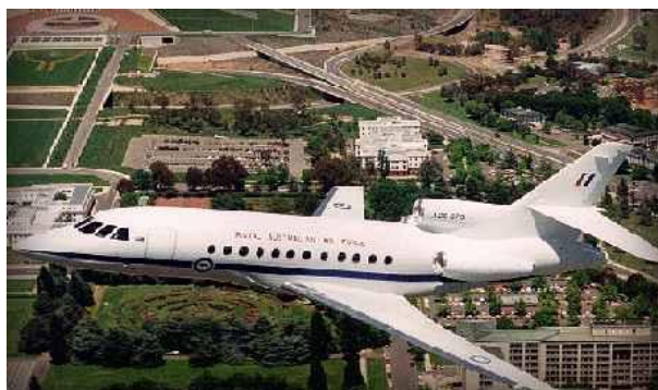
Above - Dassault Falcon 900 used to carry Australian and visiting dignitaries and VIPs

He even had a larger seat belt devised for the King of Tonga.