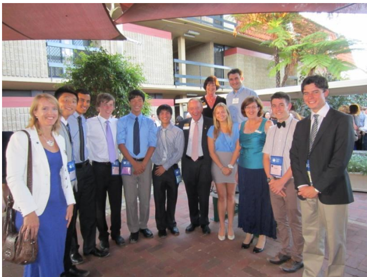
RCFB Host families and students NYSF dinner 2013