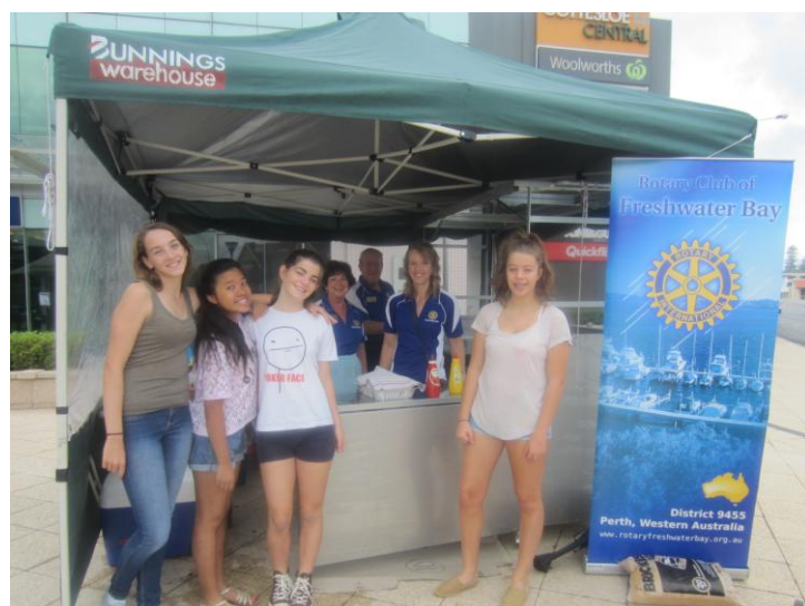
First shift of Interactors and RCFB members

Feedback from Bunnings Cottesloe was also very positive saying “Your group was absolutely fantastic on the weekend, please feel free to contact us in regards to any support we may be able to provide. ”