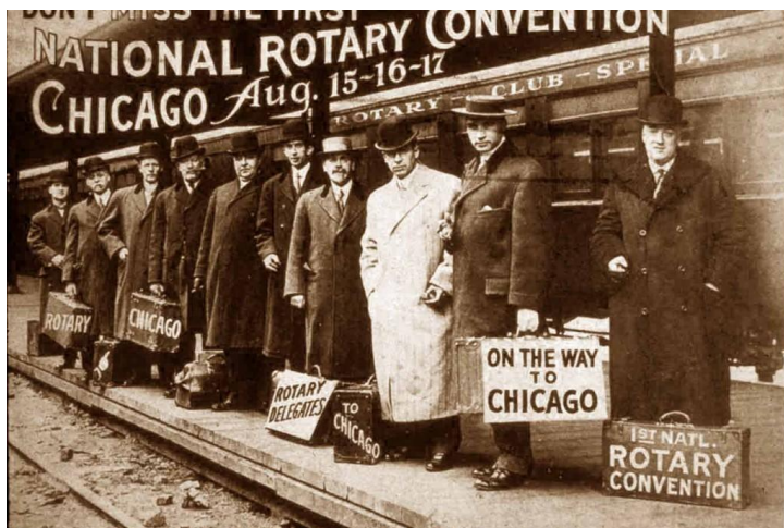
Early Rotarians at the railway station ready to depart for the Rotary International Convention in Chicago

Please access registration form from www.rotary.org