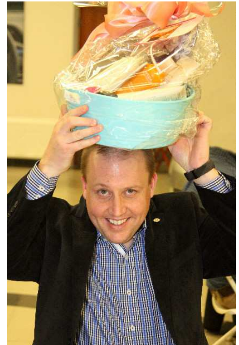
And the proud and happy winner of the Beauty Basket is . . .