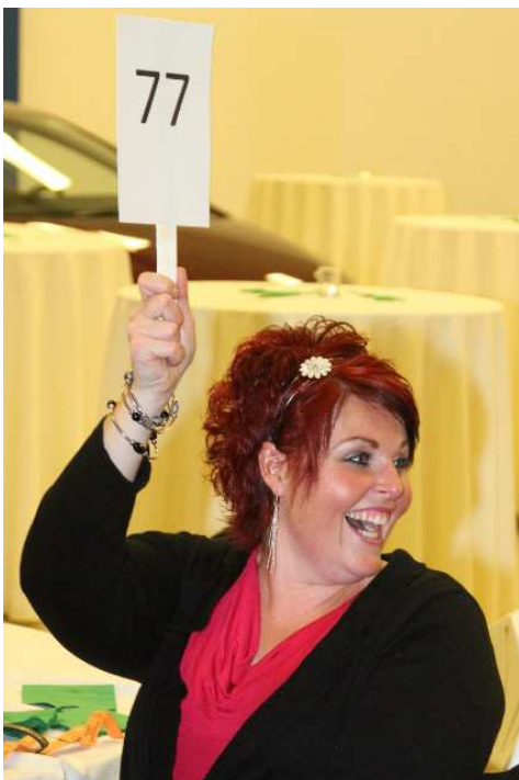
You go, girl! Bidding wars periodically perked up the crowd all night.