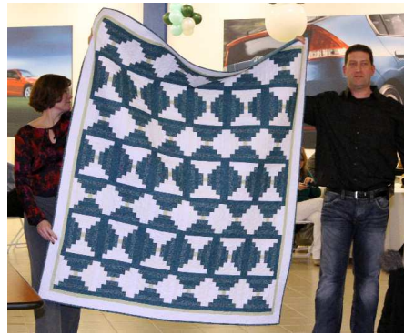
This classic-pattern quilt honored our military heroes, a theme woven throughout the proceedings.