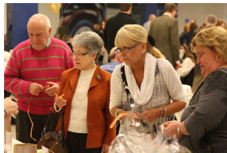
There was some serious mulling and musing goin' on all evening with folks deciding what treasures to take home.