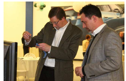
Ol' Eagle Eye confirms the winning chit for taking home a TV or iPad.