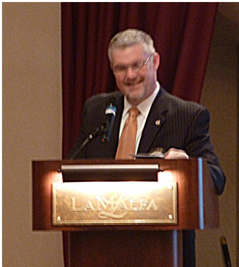
Our Prez smiles at a 3900 dollar check.