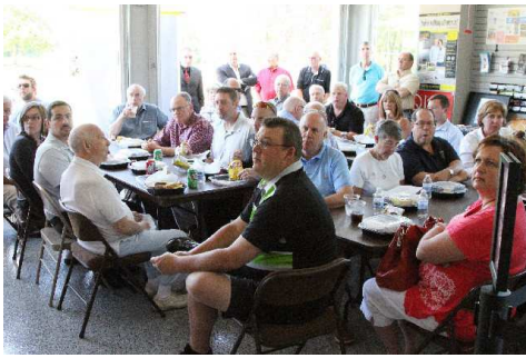
With another LaMalfa portable lunch under their belts, clubbies listen intently about Dream House benefits and proceeds.