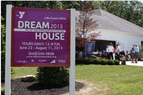
Who'da thunk it? Twenty years ago a very apprehensive Lake County YMCA board of directors – after a ton of due diligence, of course – launched what has turned out to be an incredibly successful, one-of-a-kind fundraiser.