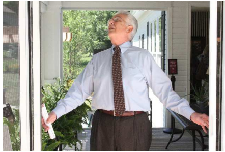
He's a judge, for cryin' out loud. You don't really expect him to know how to close one of them newfangled high-tech screen doors, do you?