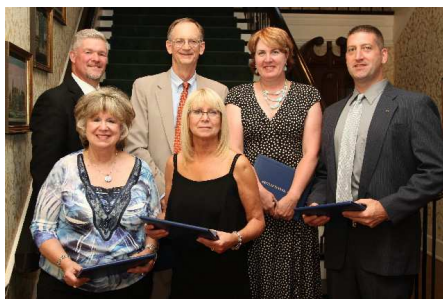
New Paul Harris Fellows join a burgeoning bunch in our club putting their money where it really counts.