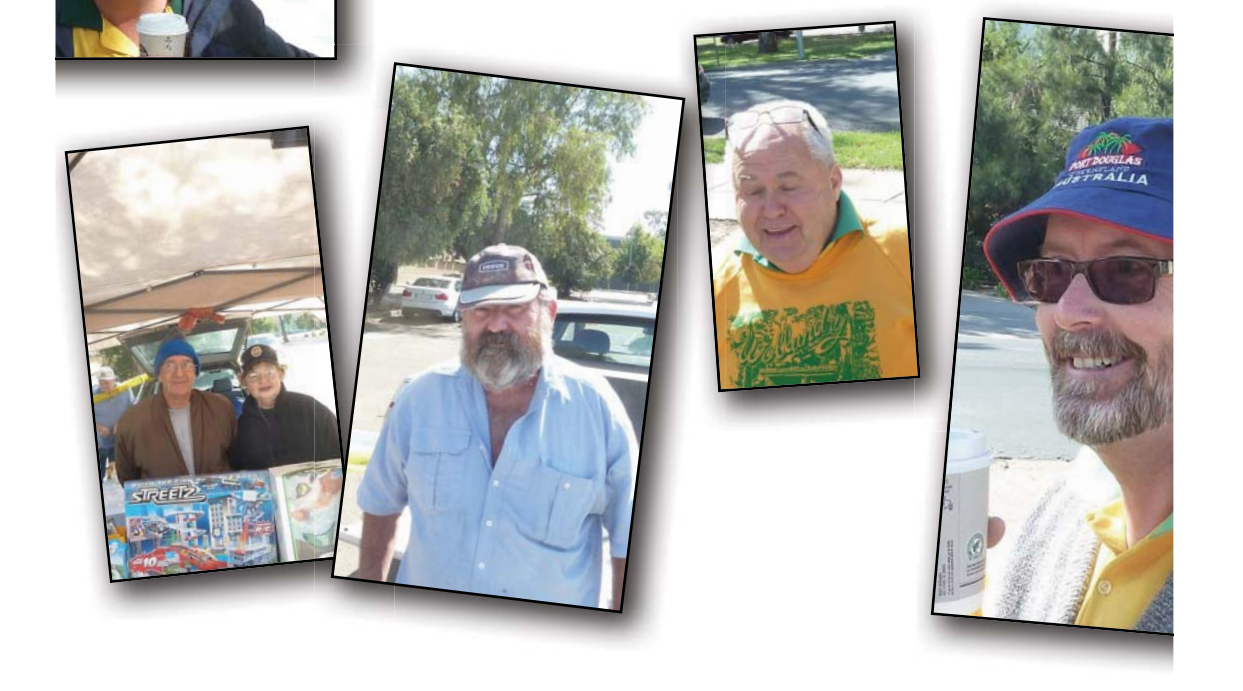
"Grow Rotary D9700" Challenge - 100 Members in 100 Days

Hamilton managed a gate of $467.00, with a grand total of $1035. An excellent result all things considered. Frank did find good coffee by going home. Dedication!!There were also a couple of faces we haven't seen around the Markets for a while. Great to see them again!