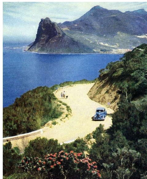
Chapman's Peak Drive Circ 1952

Thanks for your patience. Thank you to those who have contributed to this issue. I do very much depend upon your input to make a publication that we all look forward to reading. As I think this issue makes clear, we are a very vibrant club. We have some fantastic members and while we don't expect all to be at the coal face we do need to each contribute in his or her own way.